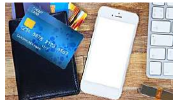
ABM MyUniverse® Credit card: the more you spend, the more you earn.