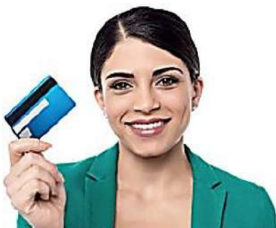
Go Cashless with Credit Card. Get Rs200 Paytm! BankBazaar.com