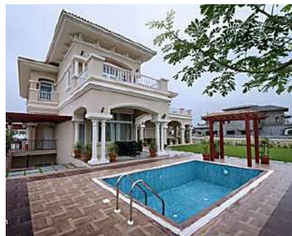
Luxe Villas flanking an award winning Golf Course Adani Realty