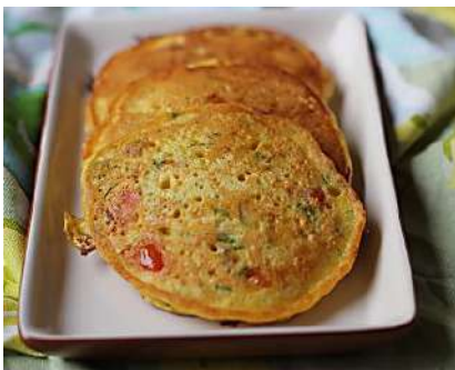
Make your life healthier with tasty oats recipes! Saffola Fit Foodie