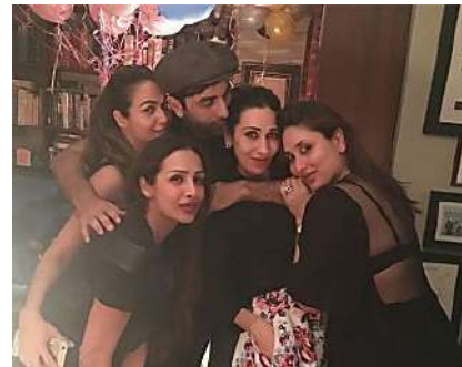
Top 5 Nightclubs & Lounges Where Celebrities Party LiveInStyle by USL – Diageo