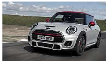
Departures International Top 10 small city cars