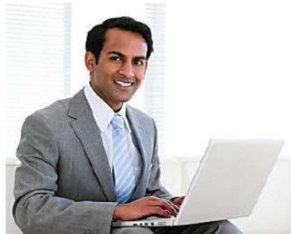
Salary Credited! Take the wise step now ABM MyUniverse®