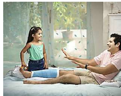
Cashless facility at 4900+ Hospitals. Buy Religare Health Insurance Today Religare Health Insurance