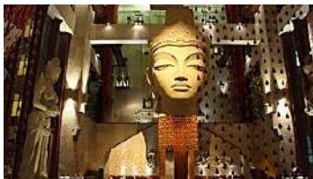
LiveInStyle by USL – Diageo 8 Lounges you surely can't miss to visit in India