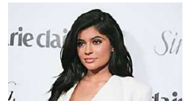
Mansion Global At Just 19, Kylie Jenner Buys Third Home