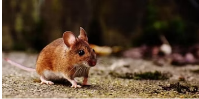
Rat bites 8-year-old boy in fast food restaurant in Hyderabad; case booked