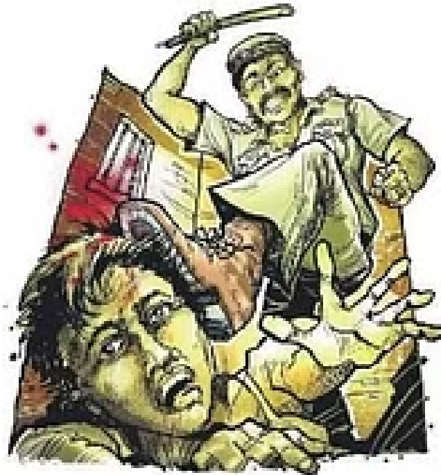
Tamil Nadu: IPS officer accused of removing teeth of 10 men shifted out