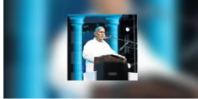
Balm to the soul