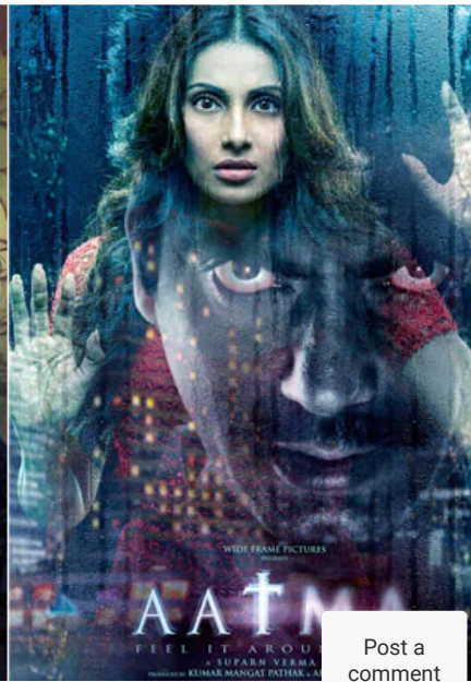
Ek Thi Daayan and Aatma are the recent films that deal with witchcraft and occult. Ek Thi Daayan and Aatma are the recent films that deal with witchcraft and occult.