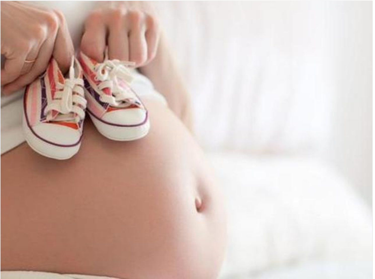
Supreme Court tells high courts to ensure that complaints against pre-natal diagnostics are fast-tracked

Concerned over the declining sex ratio in the country, the Supreme Court on Tuesday passed a raft of measures including fast-tracking legal proceedings for effective implementation of the law that bans pre-natal diagnostics.