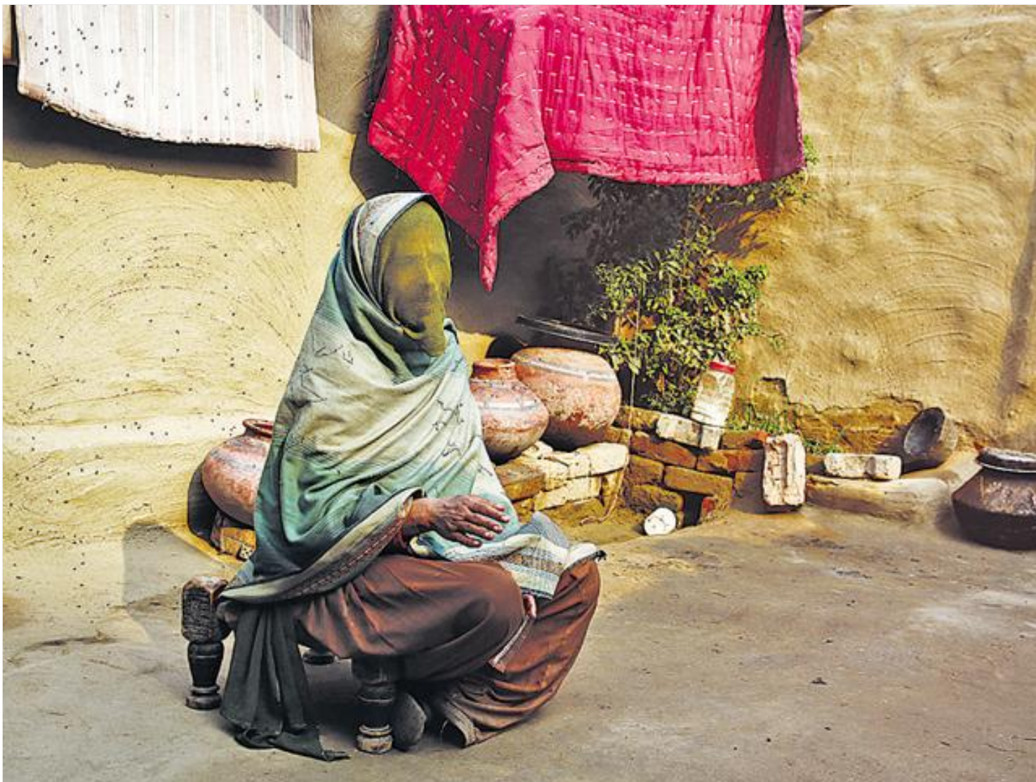
A woman who was trafficked to Haryana covers her face. In areas with poor sex ratio, trafficking of brides from other states is common.

An ultrasound test costs Rs 200-300 in a government hospital, but the charges at a private clinic could run up to Rs 30,000 and more for parents who want to know the sex of their unborn baby.