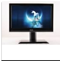
Philips 24 inch Full HD LED TV -...