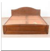
Upton Teak King Bed with Storage -...