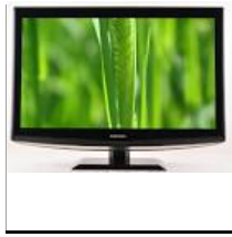
Samsung 37 inch HD Ready LCD TV -...