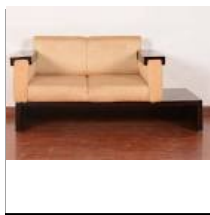
Tamala Two Seater Sofa - Buy Sofa...