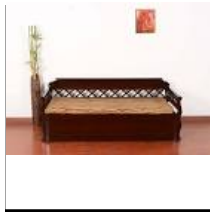
Dorian Teak 2-Seater Sofa With...