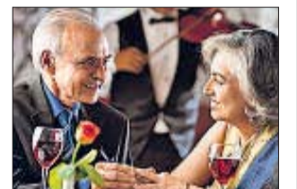
The typical luxury-goods buyer is 40-plus.