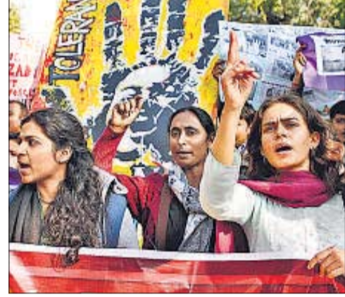
Women and students participate in a 'freedom parade' from Mandi House to Jantar Mantar in New Delhi on Saturday.

On Saturday, students from Delhi University, JNU and Jamia, as well as many women professionals, turned up for the march to ensure public pressure on authorities does not die down. Unfazed by tight security,